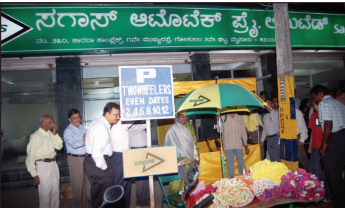
Sagas ensures minimum requirement for all. Sagas sponsored chair, table with umbrella for the road side flower vendors, it shelters them from sun and rain.