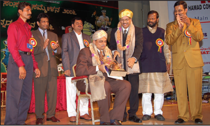
Our beloved MD receiving GLOBAL MAN AWARD from Bahrain Kannada Koota.